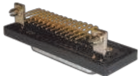
R/A PC pin