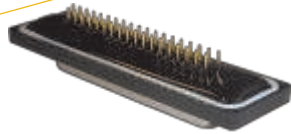
Straight PC pin