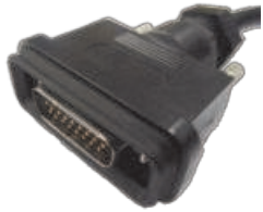
Hoods Assembly & Molded