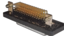
R/A PC pin