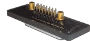
Straight PC pin

Power Contact Ratings 10, 20, 30 & 40 Amp