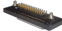
Straight PC pin