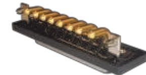
R/A PC pin